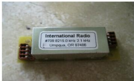
INRAD 2.1 kHz filter for R4C Asking Price: $75.00

The following equipment is up for sale. Will accept PayPal, cash, MO, or personal check. Shipping is available for additional cost. For more information on any of the listed items please email me at aj9c@indy.rr.com . Prices are listed below the pictures.