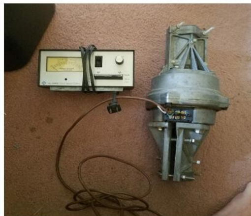
Alliance HD-73 Rotor with Control Box Asking Price: $150.00 Shipping Extra