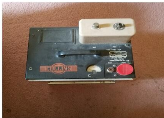
Remote Antenna Tuner Picture 2

I purchased this to make a remote antenna tuner. There is a vacuum variable capacitor with a motor and a ribbon inductor with the motor. The unit is complete. Asking Price: $125.00