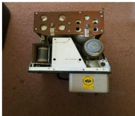
Remote Antenna Tuner

I purchased this to make a remote antenna tuner. There is a vacuum variable capacitor with a motor and a ribbon inductor with the motor. The unit is complete. Asking Price: $125.00