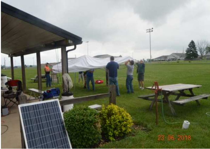
Crew setting up the portable shelter