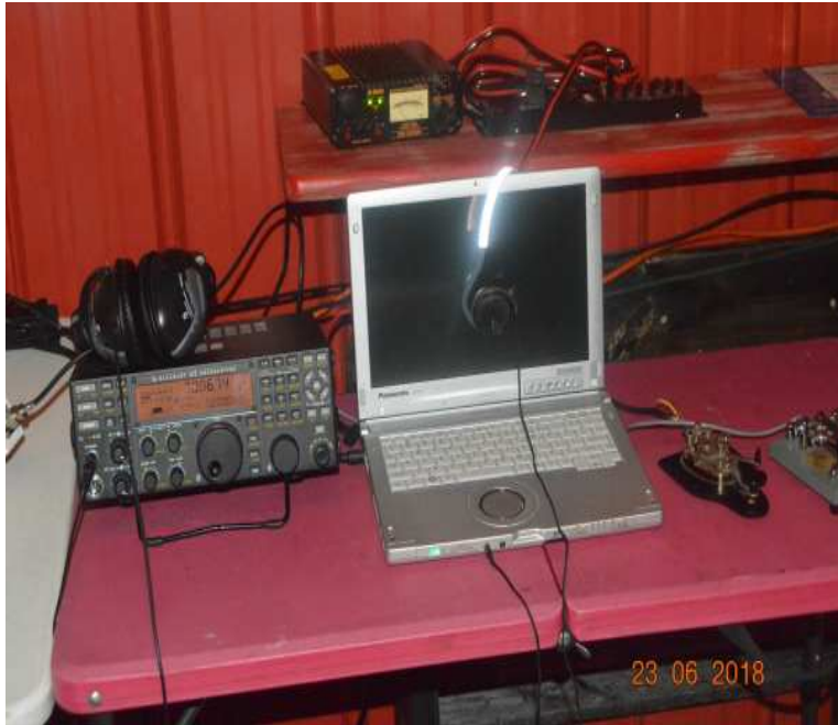
One of the HF stations