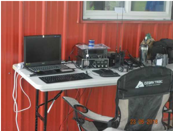
One of the HF Stations being used for Field Day