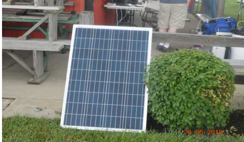
The solar panel used at one of the HF Stations