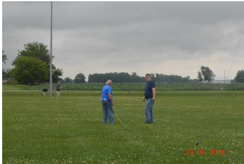
Crew setting up one of the HF Dipole antennas