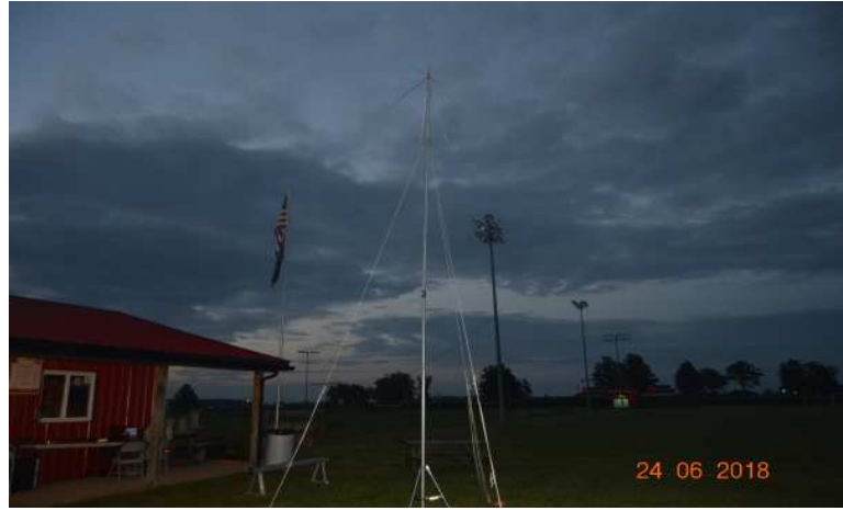
The Discone Antenna used for 6 meters