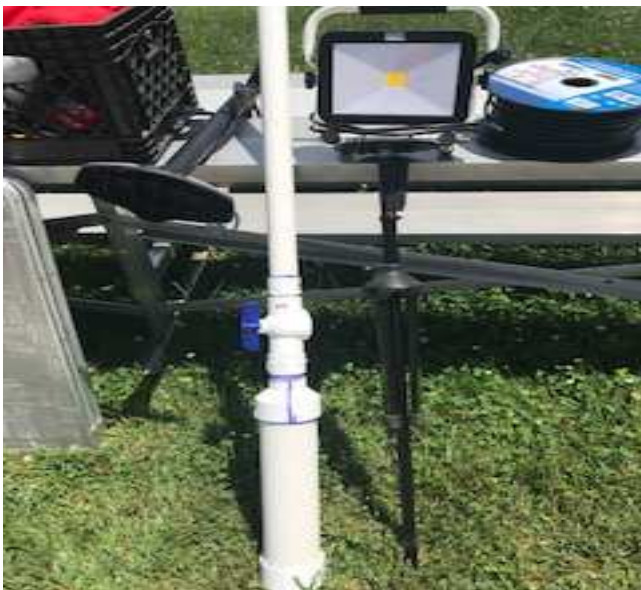
← The launcher used for stringing up the Dipole antennas