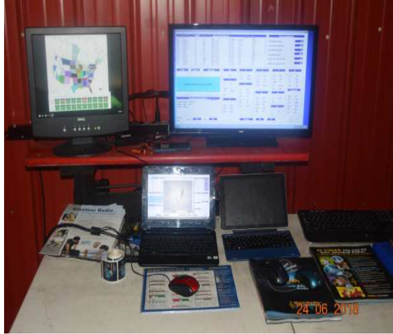
The hub of the logging system