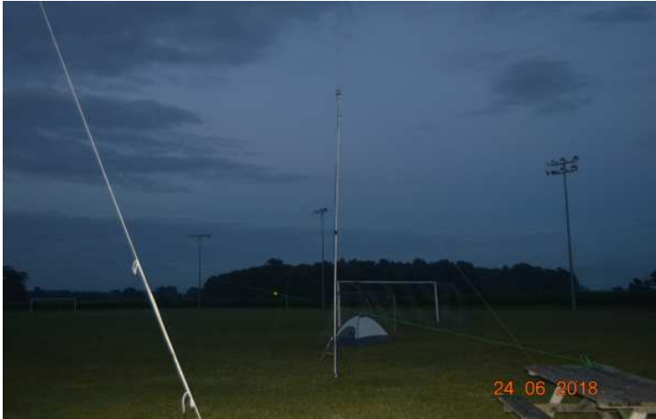
J-Pole antenna used for the D-Star Radio