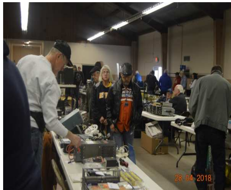
2018 North Central Indiana Hamfest