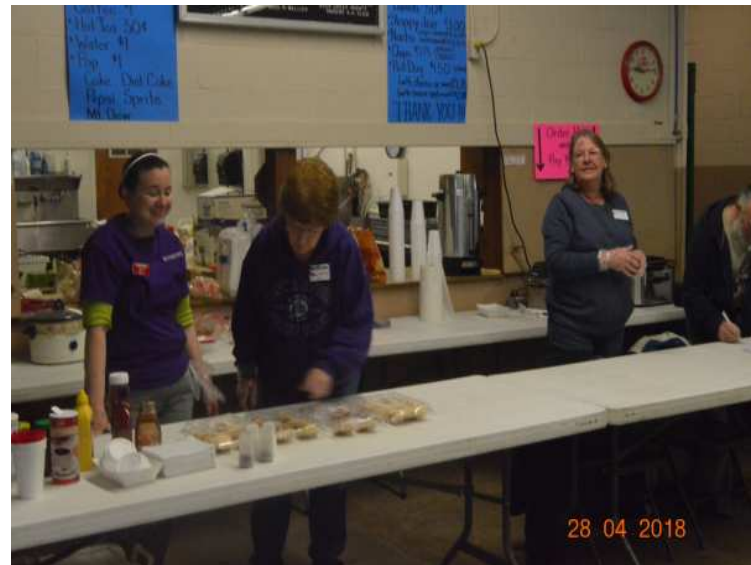
The kitchen crew serving good eats at the Hamfest