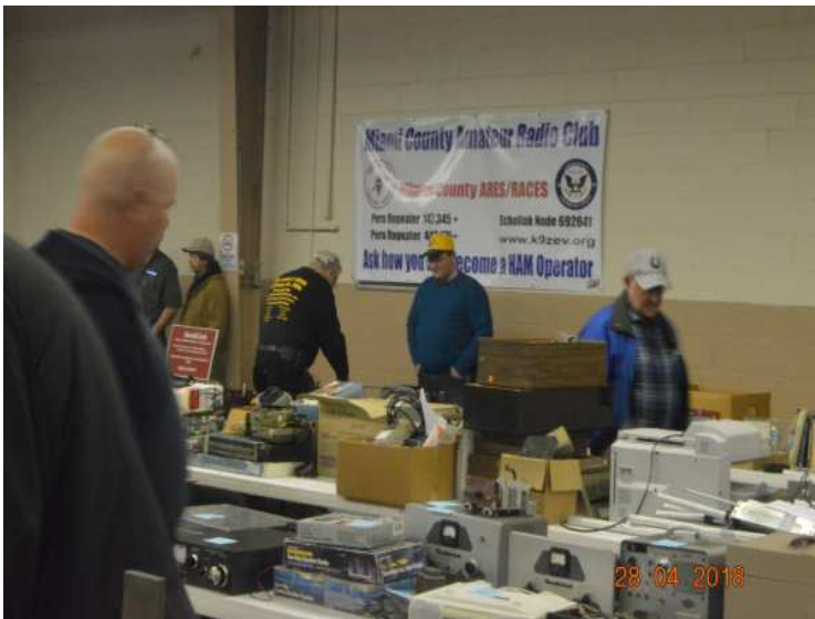
Miami County Amateur Radio Club