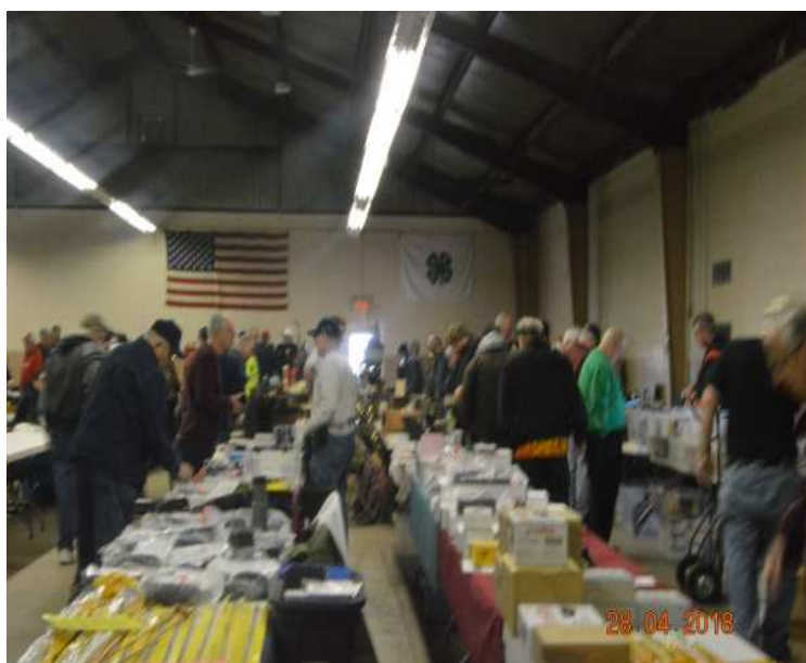
Amateur Accerssories at North Central Indiana Hamfest 2018