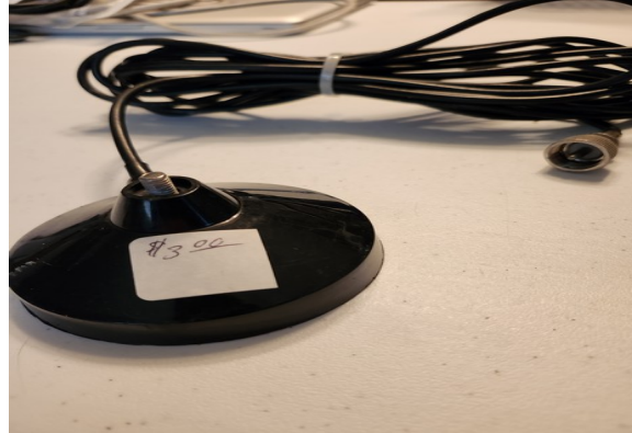
Mag Mount Antenna Base Asking Price: $3.00 OBO