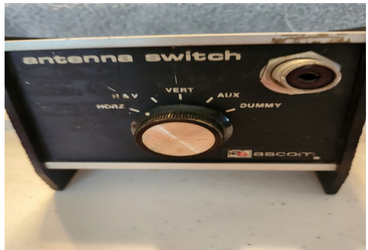
Ascom Antenna Switch Asking Price: $6.00 OBO