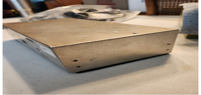
Metal Project Box – Picture #1