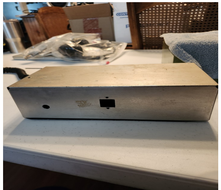
Metal Project Box – Picture #3

Measures: 10"x5"x3" Asking Price: $5.00 OBO