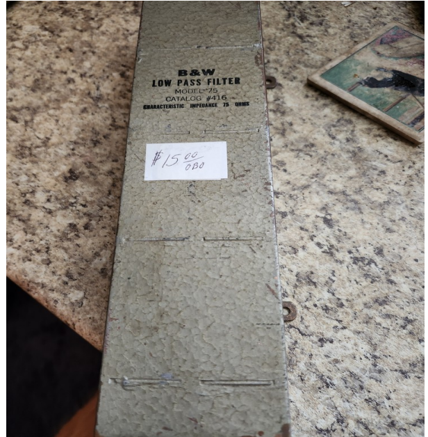
B&W Model 75 Low Pass Filter Asking Price: $15.00 OBO