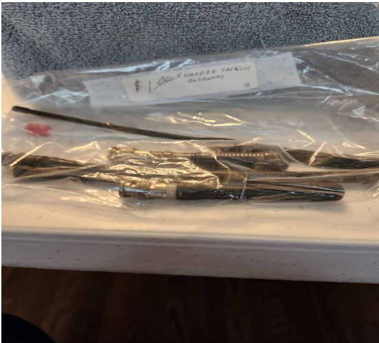
BNC HandiTalkie Antennas QTY: 4 Asking Price: $1.00 for bag