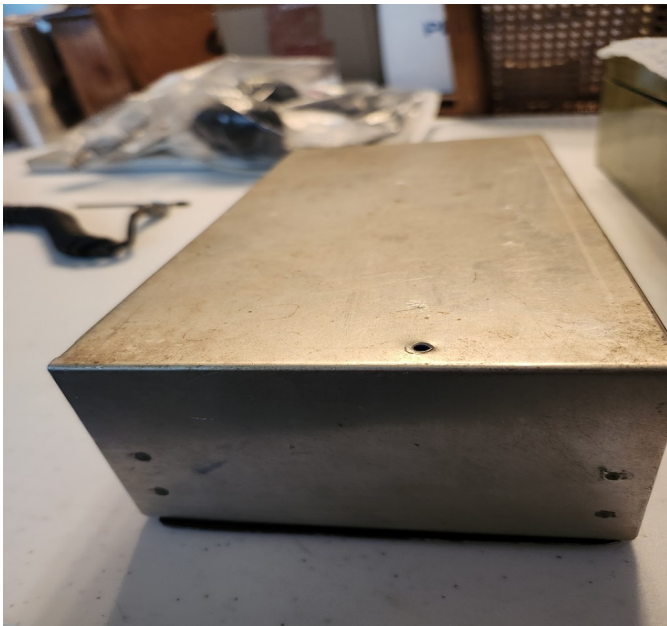
Metal Project Box – Picture #2