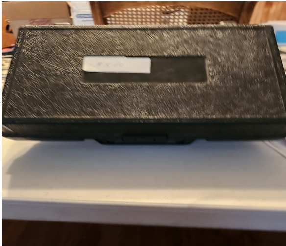
Plastic Project Box Measures: 12"x8"x4" Asking Price: $5.00 OBO