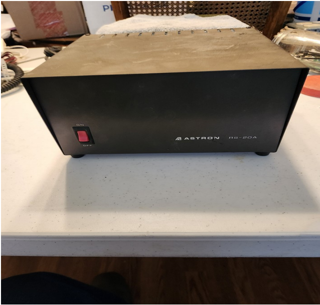
Astrom RS-20A Power Supply Asking Price: $40.00 OBO

Solid State electronically regulated. Feature fold-back current limiting to protect the power supply from excessive current or shorted output. Chassis mounted fuse. Less than 5 mv ripple peak to peak (full load and low line).