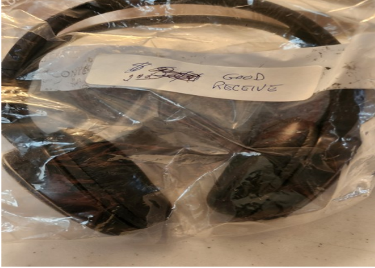
Westinghouse AM/FM Headset Radio Asking Price: $2.00 OBO