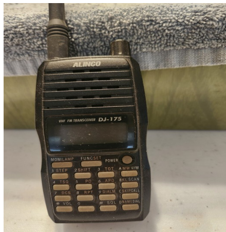
Alinco DJ-175 Handheld VHF/UHF Transceiver

The Alinco DJ-175 2 meter HT sets standards in features, convenience and easy operation. The DJ-175 sports an alphanumeric display for easy memory management. It has an ergonomic design that is user friendly and the 5-watt output battery is standard. Be prepared for virtually any selective calling situation or gaining access to repeaters with 39-tone CTCSS, 104 DCS, Tone-bursts and DTMF encoding, all included at no extra cost. Best of all, DJ-175 retains the proud Alinco tradition of quality construction and excellent value. Enjoy extended receive coverage from 136-173.995 MHz.