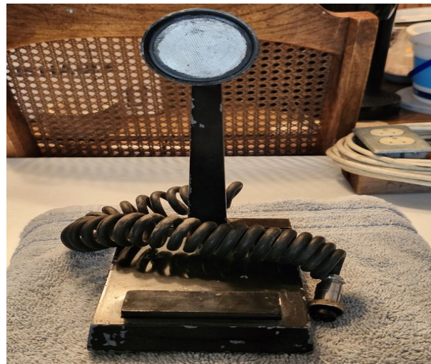
Base Station Microphone Asking Price: $5.00 OBO